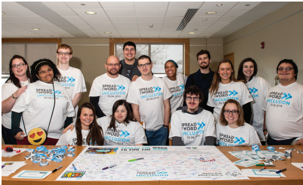
The College Experience program recently participated in Spread the Word: Inclusion Day on March 6th at Hobart and William Smith Colleges. We were thrilled to see the college community come together and make their pledge to take action for inclusion for all.

Specific to HWS, students enrolled in the Transition and Disability class are being paired up with the College Experience students, working together outside of class on readings, projects, and homework assignments. These expanding friendships have been a valuable experience for everyone involved.