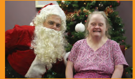
Kids and adults of all ages came to visit with Santa at this annual event hosted by The Autism Center.

On December 13th, The Autism Center at Ontario ARC hosted its 3rd annual Sensitive Santa Evening. The festive event was geared toward kids and adults with autism looking to visit with Santa in a calm, sensory-friendly setting.