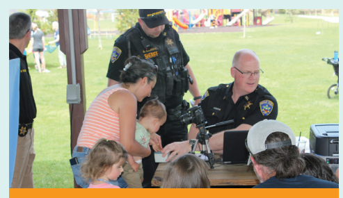
Officers from the Ontario County Sherift's Department also joined us for the event, taking fingerprints for Project Lifesaver and Operation Safe Child, initiatives designed to promote child safety.